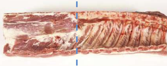
2 The rib section (Thoracic) of the loin needs to be removed.