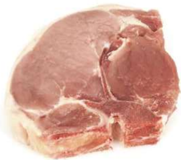
4 T-bone Chops.