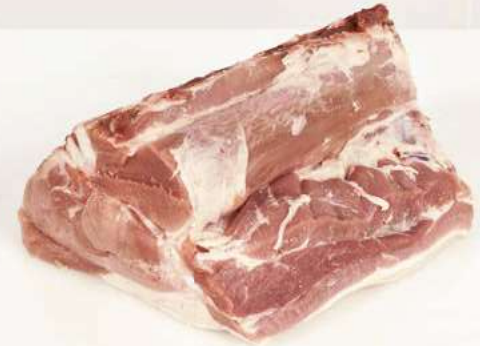
3 Cut the fillet section (Lumbar) between the vertebrae into T-bone chops.